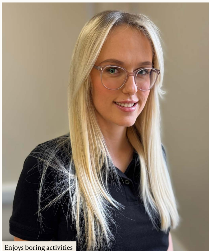
Enjoys boring activities